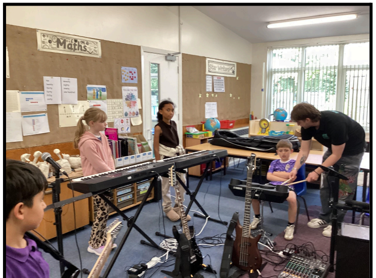
Check out our children having great fun!

It isn't too late to join one of our Rocksteady bands - sign up using the details shared on Arbor.