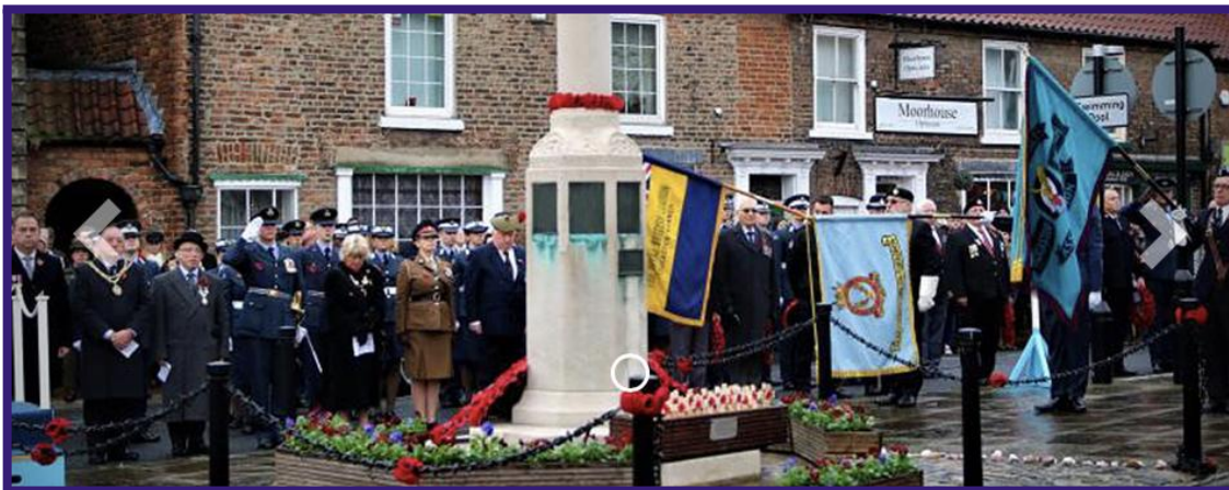
Tadcaster Remembrance Day Parade – Sunday 12th November

Click here for more information: Remembrance Sunday