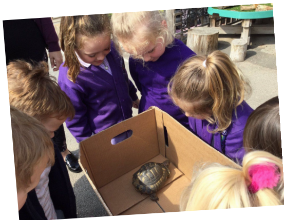
Meeting the Tad tortoise in Early Years