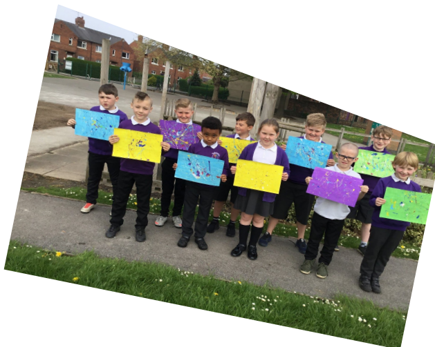
Some of Jupiter team getting artistic!